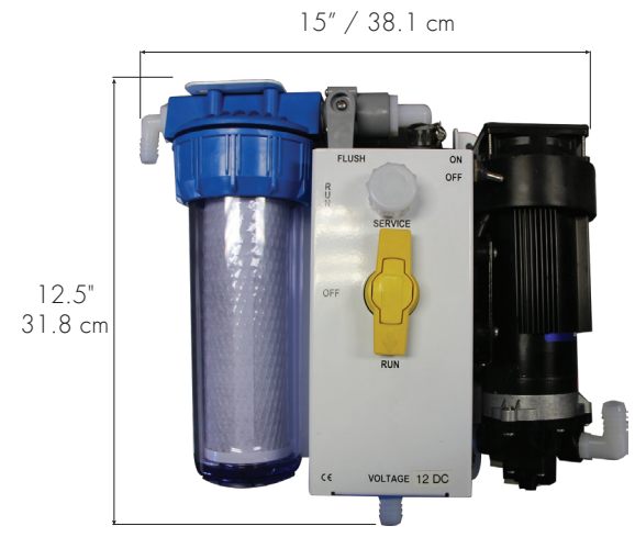
Feed Pump Module Depth 4.5'' / 11.4 cm