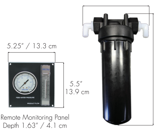
Pre-Filter Depth 6" / 15.2 cm