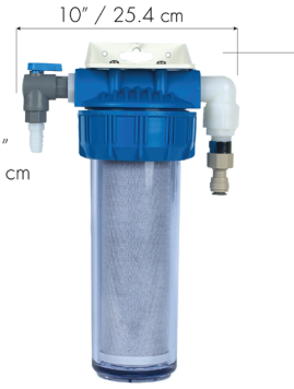
Charcoal Filter Depth 6" / 15.2 cm