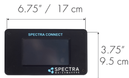
Additional Spectra Connect Display Depth 1" / 2.5 cm