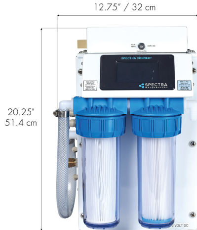
Feed Pump Module Depth 13.5" / 34 cm