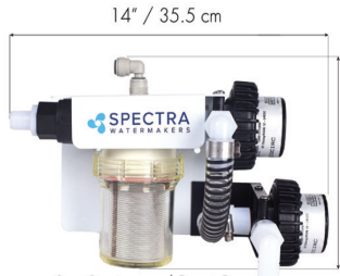
Sea Strainer and Boost Pump Depth 4" / 10 cm