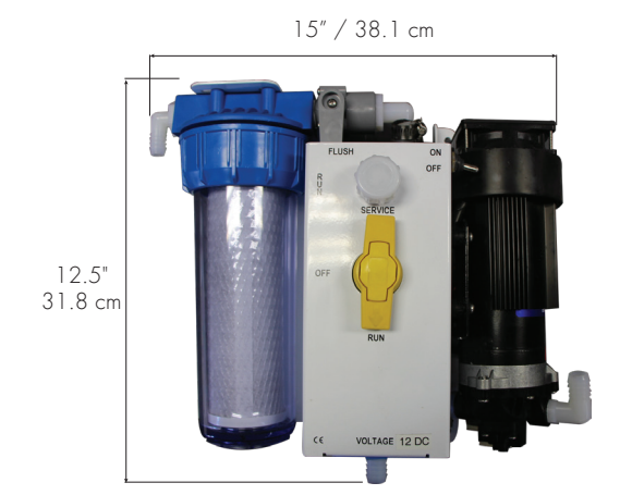
Feed Pump Module Depth 4.5" / 11.4 cm