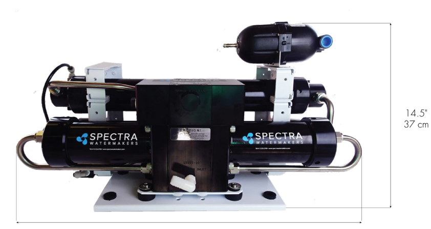
27" / 69 cm High Pressure Clark Pump and Membrane Depth 12" / 30.5 cm

Katadyn reserves the right to modify products