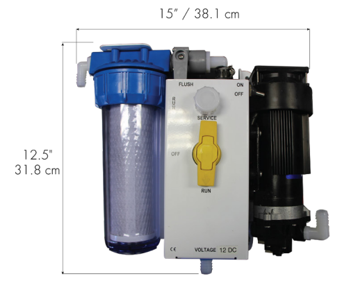
Feed Pump Module Depth 4.5" / 11.4 cm