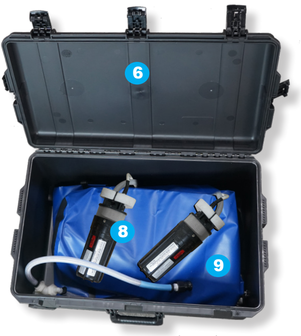
*Room in pump case for 24 filters