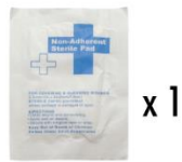
Non adherent gauze 5 cm x 7,6 cm