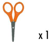
Pair of scissors