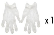
Pair of vinyl gloves