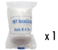
Rolled gauze 5 cm x 4,5 m