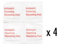
Chlorhexidine towelettes 4 cm x 4 cm