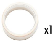
Adhesive roll tape 1,25 cm x 2,29 m