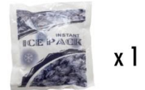
Instant ice pack