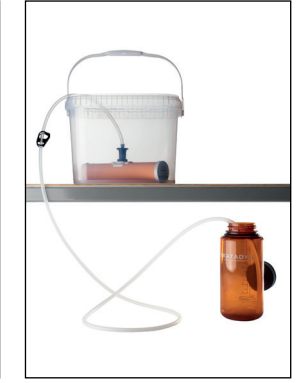
Buckets not included